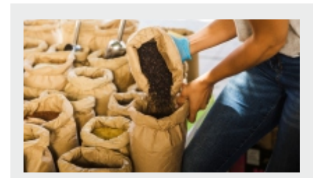
Organic Waste Recycling