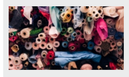
Textile And Fabric Recycling